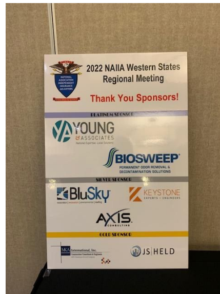
Thank you to our sponsors for making our meeting possible!