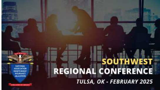
Southwest Regional Conference February 2025 Tulsa, OK