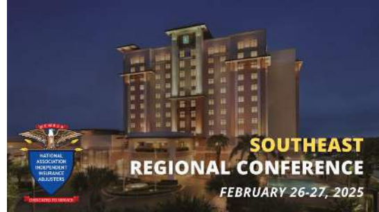
Southeast Regional Conference February 26 - 27, 2025 Embassy Suites by Hilton Orlando Lake Buena Vista South 4955 Kyngs Heath Road Kissimmee, FL 34746